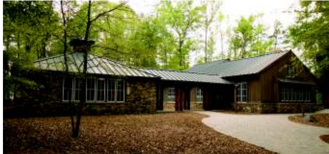
The arts and crafts multi-purpose building.

At the day camp, higher-functioning brain-injured patients will spend the day in activities such as horses, horticulture, speech and occupational therapy, and arts and crafts.